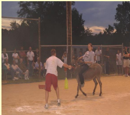
She's SAFE! HOMERUN!

Clean-up after our show is just like clean-up after a regular event!